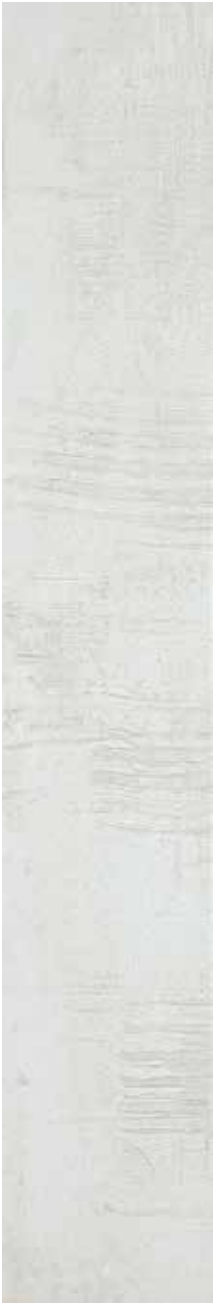
16.5 x 100cm (6.5" x 40") DM.KN.IVO.6,5X40.MT