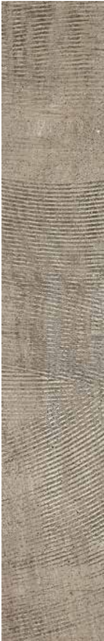
16.5 x 100cm (6.5" x 40") DM.KN.MKA.6,5X40.MT