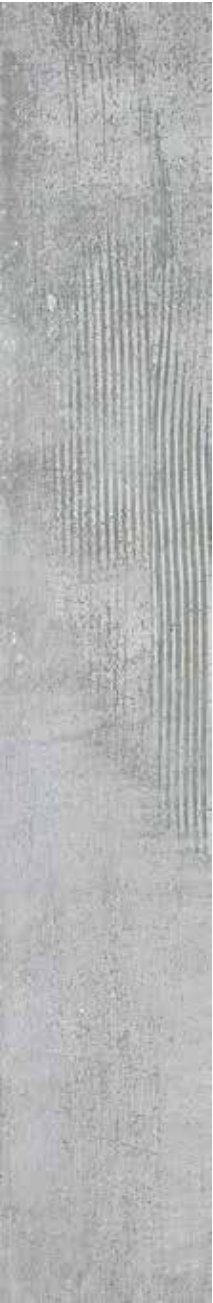
16.5 x 100cm (6.5" x 40") DM.KN.CMT.6,5X40.MT

All items shown in this document are part of Olympia's stocking program. For special orders, please contact your Olympia Tile Sales Representative.