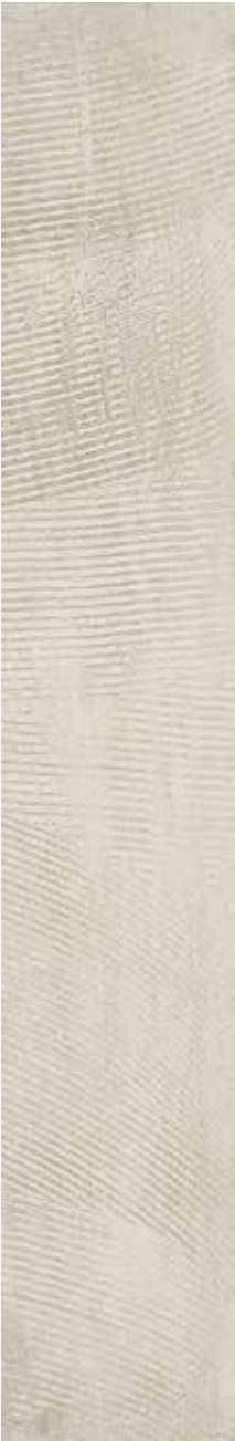
16.5 x 100cm (6.5" x 40") DM.KN.SND.6,5X40.MT