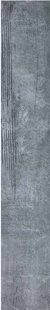
16.5 x 100cm (6.5" x 40") DM.KN.MTL.6,5X40.MT

All items shown in this document are part of Olympia's stocking program. For special orders, please contact your Olympia Tile Sales Representative.